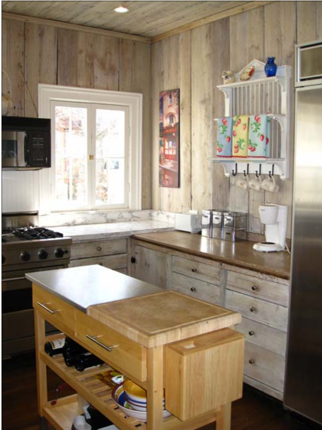
Open design kitchen ideal for the culinary connoisseur with Viking commercial grade range, wet bar with wine fridge a built in audio system.