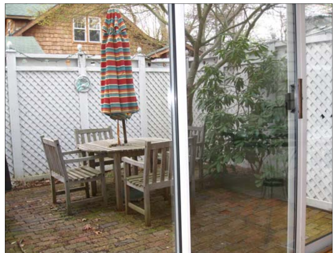
Wonderful dining room in the glass enclosed porch area overlooking your private grounds. You will love the floor to ceiling glass windows which allow for plenty of daylight.