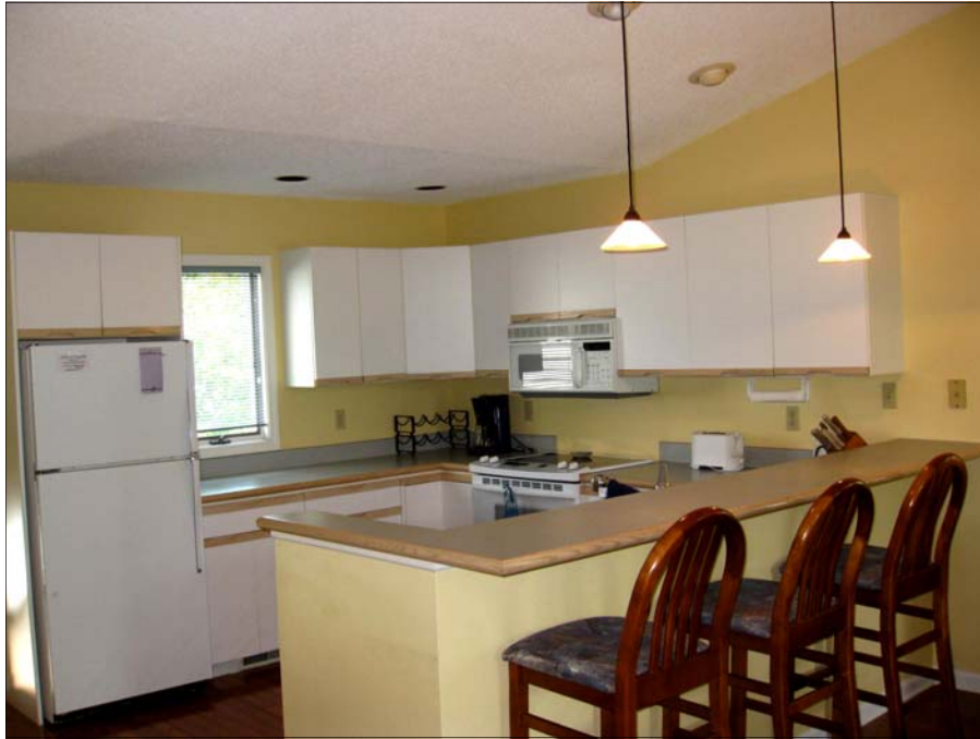
More than ample kitchen with a delightful with snack bar.