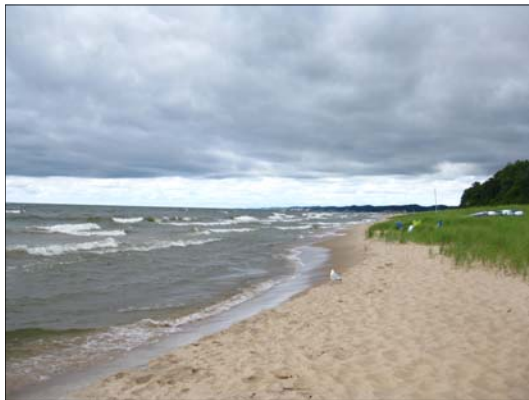
Walk to Lake Michigan at Douglas Beach