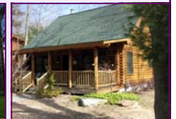
College Fund Steps away from Goshorn Lake