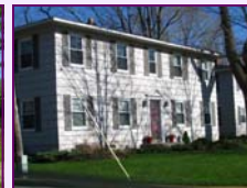
Snug Harbor In the heart of downtown Saugatuck