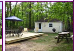
Cottage by the Lake Views of and access to Lower Scott Lake

If you have extra guests ... We have room!