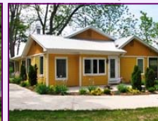
Hammock Hollow Centrally located to all area activities