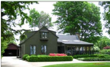
2971 Lakeshore Drive