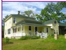
On Golden Pond Country setting close to all town activities