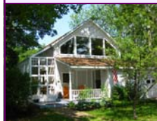
Good Life 'On the hill' near all the action of town